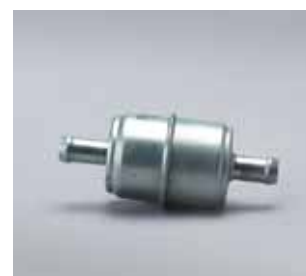
P551770 Komatsu 20704A1100