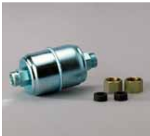
P550446 JOHN DEERE AR103220, CUMMINS 3318919