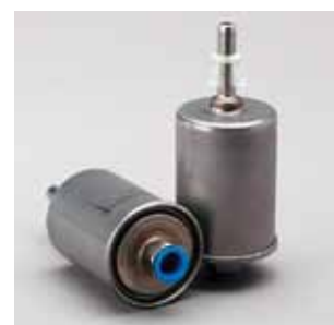
P552371 GMC 25121293