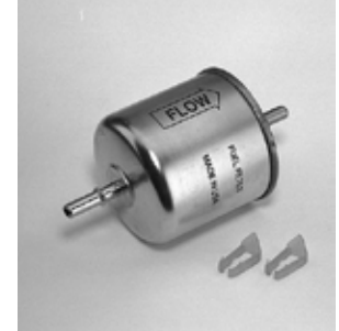
P550126 FORD E3FZ9155C