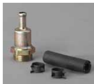
P550593 FORD MOTORCRAFT FG19B