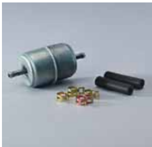
P550094 UNIVERSAL 1/4" O.D. LINES,