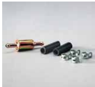
P550454 FORD D3FZ9155A, D2RY9155A -- 2 HOSES 4 CLAMPS INCLUDED