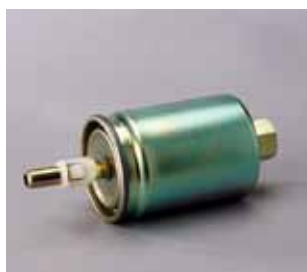
P550508 AC LIGHT DUTY, GF645, G645