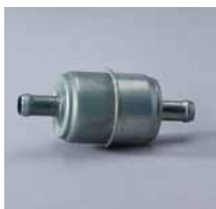
P551771 GM 25055347