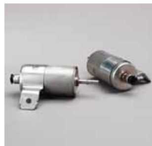
P552439 Chrysler 4708317, 52019023, 52020016