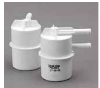
P552401 Mitsubishi MB433774