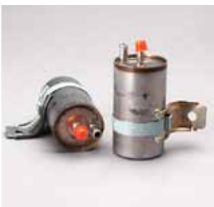
P552403 Chrysler 4443452, 4443454, 4549712