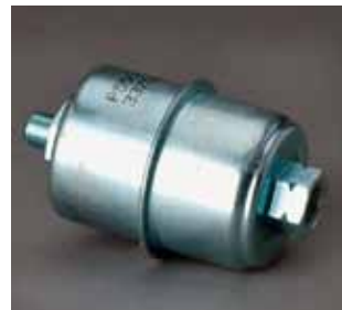
P550457 JOHN DEERE T19743