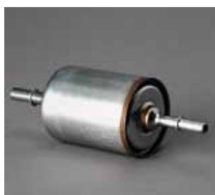
P551759 CHRYSLER 4554040