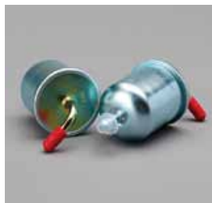
P552437 Nissan 16400-72L00