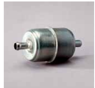
P550433 CASE IH D145357