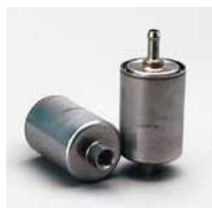
P552366 GM 5651944