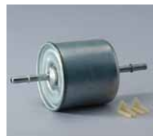
P550967 FORD LIGHT TRUCK