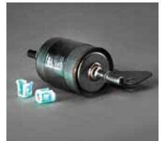
P552397 GMC 25121472