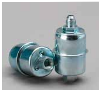
P552482 JOHN DEERE RE38818