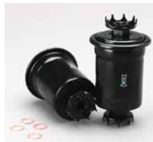
P552400 Chrysler MB504732, MB504750; Suzuki 15410-61A00