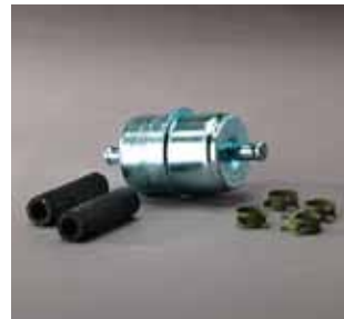
P550090 FORD, GMC -- 2 HOSES 4 CLAMPS INCLUDED