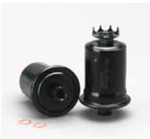
P552398 Mitsubishi MB504753, MB658689; Toyota 23030-74020, 23300-19045