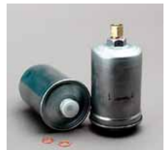
P552442 Audi 893133511; Ferrari 117792; Volkswagen 447133511; Volvo 13895628