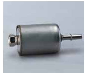
P550504 GM LIGHT TRUCK, AC GF624, G580