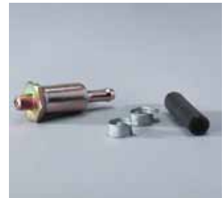
P550091 FORD, MOTORCRAFT FG14 -- 1 HOSE 2 CLAMPS INCLUDED