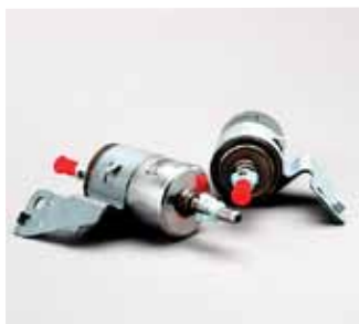
P552448 GMC 25121978