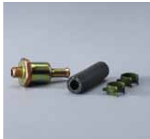
P550016 FORD D7TE9155A, MOTORCRAFT FG778 (1 HOSE 2 CLAMPS INCLUDED)