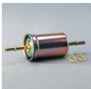
P551772 FORD F89Z9155A