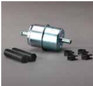
P550012 PICKUPS AND CARS -- UNIVERSAL 5/16" 2 HOSES 4 CLAMPS