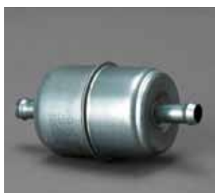
P550974 CUMMINS 3826094, CASE IH STX