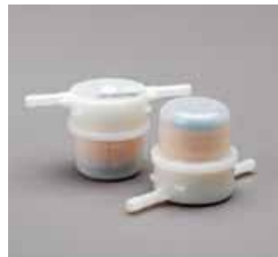
P552394 GMC 25175542; Nissan 16400-D0100, Toyota