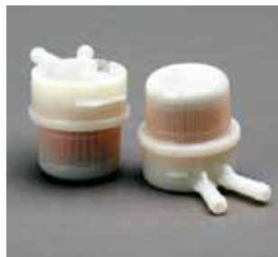
P552399 GMC 25010487