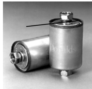
P550209 GM Light Truck