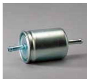
P551760 ISUZU 825053640, 8251217780