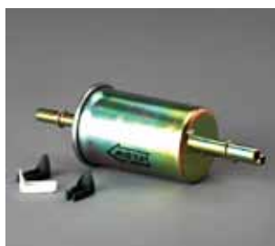
P550556 MOTORCRAFT FG1036