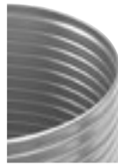
Close-up of deburred edge